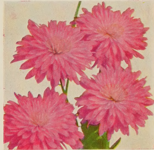
WENONAH. 75c each; 3 for $2.00